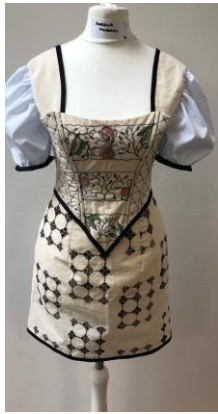
Ex BHS Student A Level Art Textiles Final piece